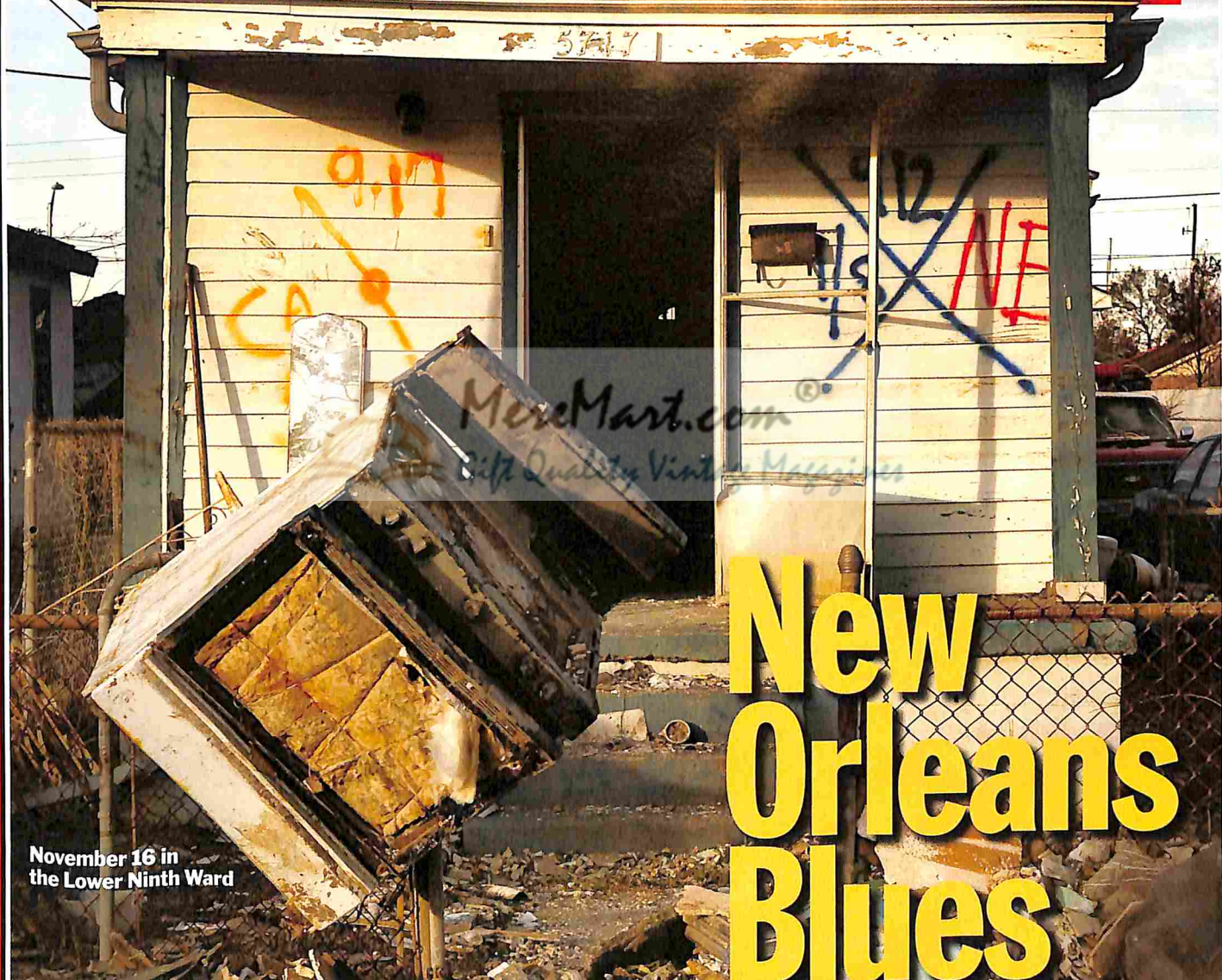
November 16 in the Lower Ninth Ward