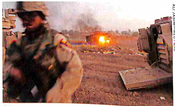
36 The wreckage of a U.S. military convoy in Baghdad